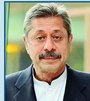
Dr. Naresh Trehan