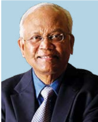
Dr. Raghunath Mashelkar Former DG, CSIR & Chairman, National Innovation Foundation