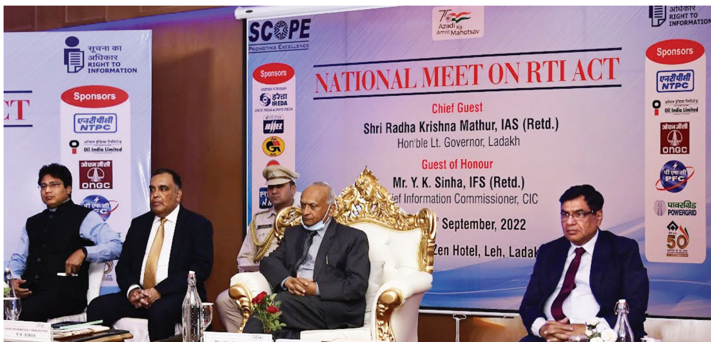
SCOPE's National Meet on RTI Act 2022 inaugurated by Shri Radha Krishna Mathur, Hon'ble Lt. Governor, Ladakh in the presence of Shri Y.K.Sinha, CIC.