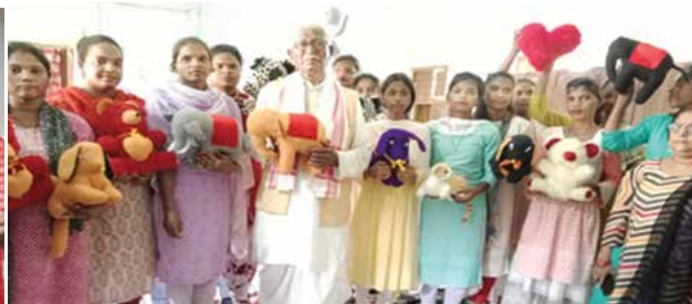
Training in progress for project beneficiaries