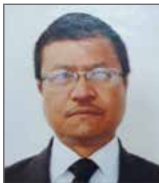
Hon'ble Shri H. Nongpluh, IPS (Retd.) State Chief Information Commissioner Meghalaya State Information Commission