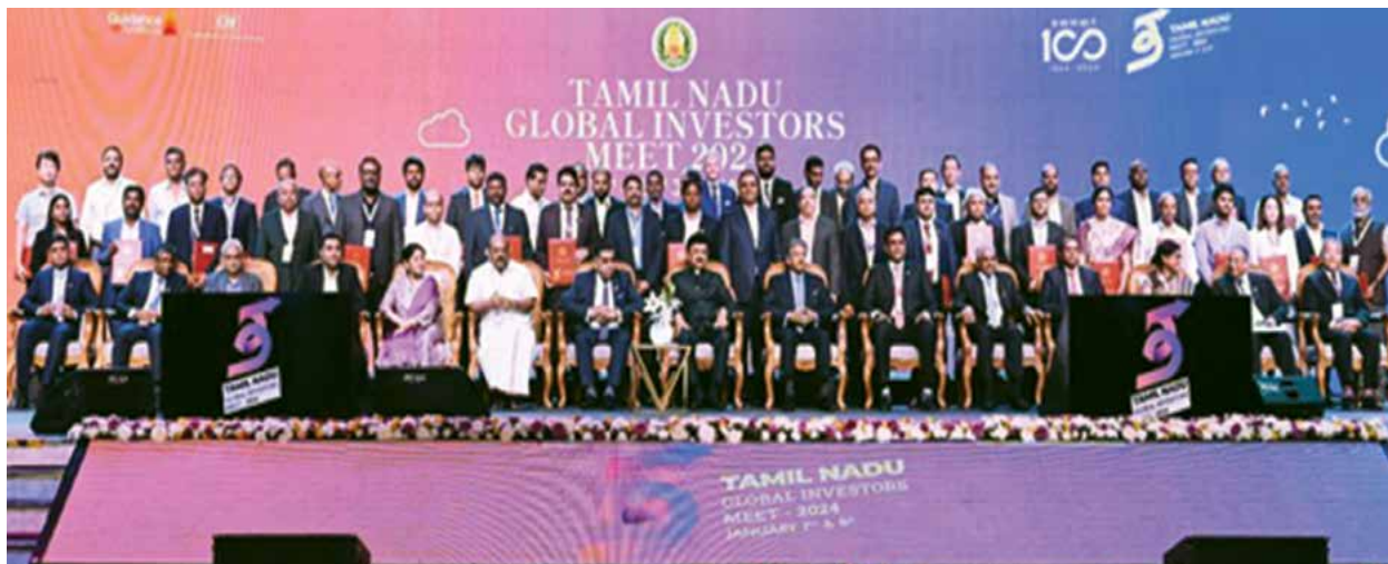
GAIL (India) Limited signed an MoU with the Government of Tamil Nadu to invest around Rs. 2,187 crore to lay approx. 320 km of Natural Gas pipeline in the state at Tamil Nadu Global Investors Meet held in Chennai recently.

GAIL (India) Limited has signed a Memorandum of Understanding (MoU) with the Government of Tamil Nadu to invest around Rs. 2,187 crore to lay approx. 320 km of natural gas pipeline in the state.