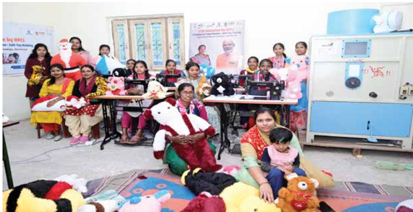
Project beneficiaries with products crafted by them under the Project

stall was setup during Diwali and Dussehra festivals and basis response for the products, areas for improvement were identified. This customer-centric approach ensures that soft toys resonate with the ever-changing demands