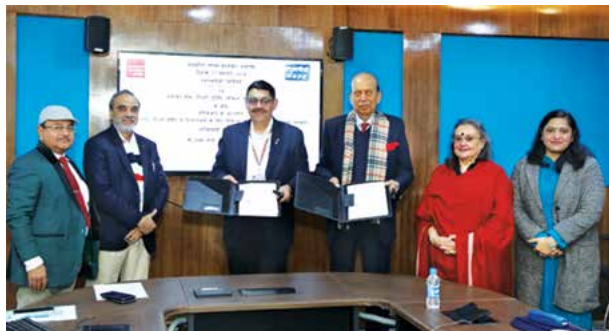
Officers of NHPC and Cheshire Home India, Delhi Unit during MoU signing ceremony in Faridabad.

A Memorandum of Understanding (MoU) has been signed under Corporate Social Responsibility between NHPC and Cheshire Home India, Delhi Unit recently at Faridabad for providing medical care and nutritional support to the physically and mentally challenged persons residing at Cheshire Home India, Okhla Road, Delhi Unit.