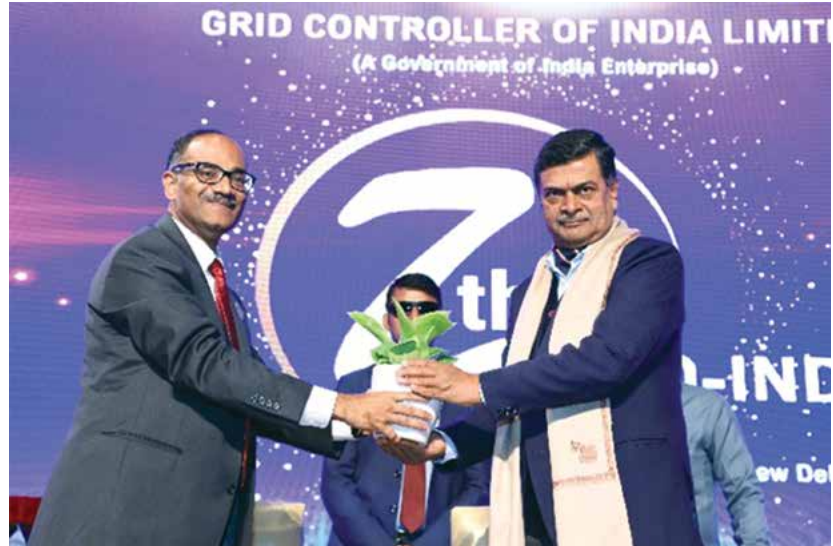
Shri S. R. Narasimhan, CMD, GRID-INDIA welcomes Shri R. K. Singh, Hon'ble Union Minister for Power and New & Renewable Energy during GRID-INDIA Day celebrations.

Addressing the gathering, Shri R. K. Singh, Hon'ble Union Minister for Power and New & Renewable Energy exhorted the GRID-INDIA employees to brace for future challenges, in line with the demands of a growing economy which aims to transition to increased share of renewable energy. "The growth up till now has been linear or sequential, but the future growth is going to be hugely disruptive. The rate at which the country is growing and the rate of transformation of power sector means that the future is going to be totally different." The Minister said that the major challenge is going to be upon GRID-INDIA since it is the backbone of the power sector,