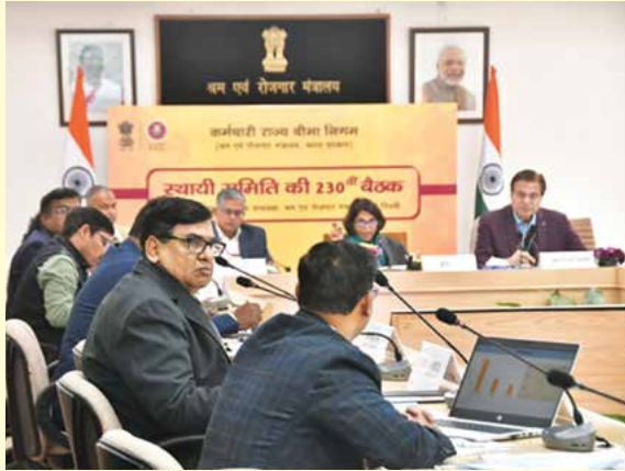
DG, SCOPE representing PSEs at the meeting of Standing Committee of ESI Corporation in New Delhi.