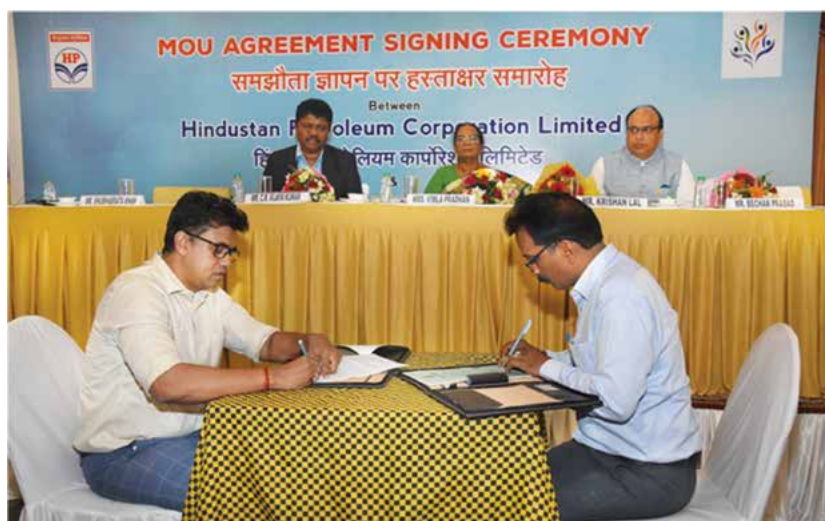
Signing of MoU for CSR Project

isolation and inadequate infrastructure exacerbate the difficulties, restricting their ability to connect with main-stream services. Cultural norms and gender-based discrimination further impede their empowerment, limiting their decision-making roles within the family and society. HPCL has emerged as a beacon of hope through its innovative Corporate Social Responsibility (CSR) initiative for these tribal women in Simdega district of Jharkhand state. As part of this CSR project, HPCL has provided necessary facilities for crafting eco-friendly soft toys, supporting skill trainings and facilitating promotion of entrepreneurship amongst these women, empowering them to become economically self-sufficient.