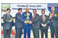
उपराष्ट्रपति श्री जगदीप धनखर (बाएं) ने सार्वजनिक क्षेत्र के संस्थानों के प्रतिनिधियों को सम्मानित किया।

नई दिल्ली: सार्वजनिक क्षेत्र के संस्थानों को उत्कृष्ट प्रदर्शन के लिए सम्मानित करने के उद्देश्य से उपराष्ट्रपति श्री जगदीप धनखर ने सोमवार को दिल्ली में एक कार्यक्रम के दौरान विभिन्न सार्वजनिक क्षेत्र के संस्थानों के प्रतिनिधियों को सम्मानित किया।