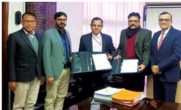
Signing of Power Purchase Agreement (PPA) between Ratle Hydro Electric Power Corporation Limited and Rajasthan Urja Vikas and IT Services Limited for offtake of power generated from 850 MW Ratle Hydroelectric Project, Kishtwar, UT of J&K.

A Power Purchase Agreement (PPA) was signed recently between Ratle Hydro Electric Power Corporation Limited (RHPCL) (a Joint venture company of NHPC Limited and JKSPDC) and Rajasthan Urja Vikas and IT Services Limited for offtake of power generated from 850 MW Ratle Hydroelectric Project, Kishtwar, UT of Jammu and Kashmir for the period of 40 years from the COD