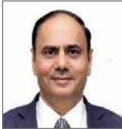
Hon'ble Shri Heeralal Samariya, IAS (Retd.) Chief Information Commissioner, CIC