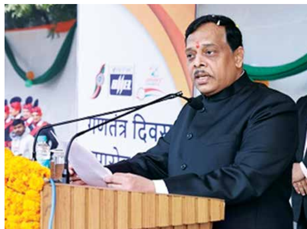
Shri Koppu Sadashiv Murthy, CMD, BHEL addresses the gathering during Republic Day celebrations at the company's township in Noida.

India's 75 th Republic Day was celebrated with fervour and gaiety by BHEL at all its offices across the country.