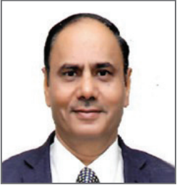
Hon'ble Shri Heeralal Samariya, IAS (Retd.) Chief Information Commissioner, CIC