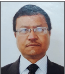
Hon'ble Shri H. Nongpluh, IPS (Retd.) State Chief Information Commissioner Meghalaya State Information Commission